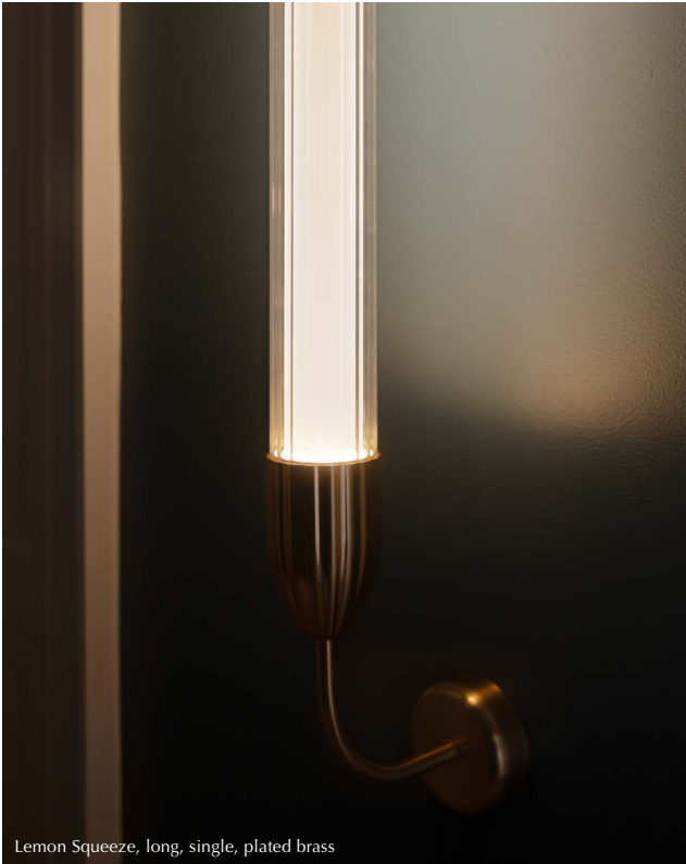
Lemon Squeeze, long, single, plated brass