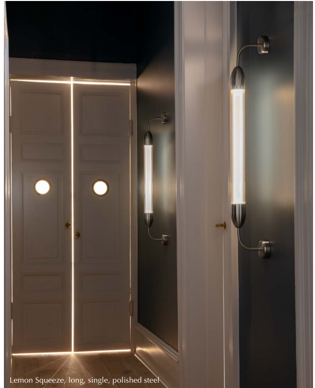
Lemon Squeeze, long, single, polished steel

Evoking nostalgic feelings and soft decorative references, UIMAGE introduces their latest lighting collection – Lemon Squeeze. Combining contemporary elegance with graceful nods to the past, the collection features a selection of wall and pendant lamps available in various sizes and finishes.